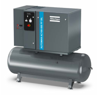
AC Silent 5.5-10 hp Ideal for work- and carpentry shops.