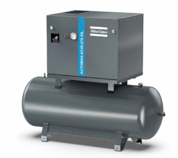
AC Silent 3-4 hp Ideal for automotive service stations.