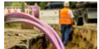
12 to 14 bar: Cable blowing and drilling