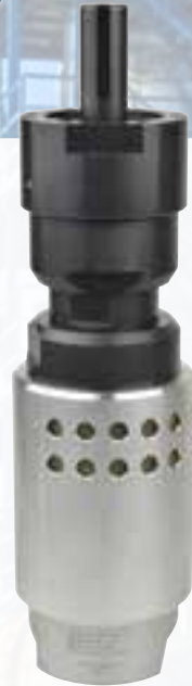
LZB77 2.25 – 2.80 Kw 3.15 – 3.75 hp